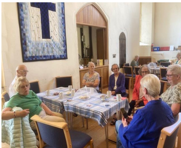
Open Door Coffee Morning

Plus, we have a Prayer Ministry Team, a team of folk preparing refreshments, and various members of our Church Family who run our Open Pantry, Open Door and 'Oasis' Service.