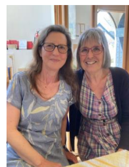
Leaders of our Ladies Group

Plus, we have a Prayer Ministry Team, a team of folk preparing refreshments, and various members of our Church Family who run our Open Pantry, Open Door and 'Oasis' Service.