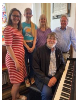
Some of our Musicians