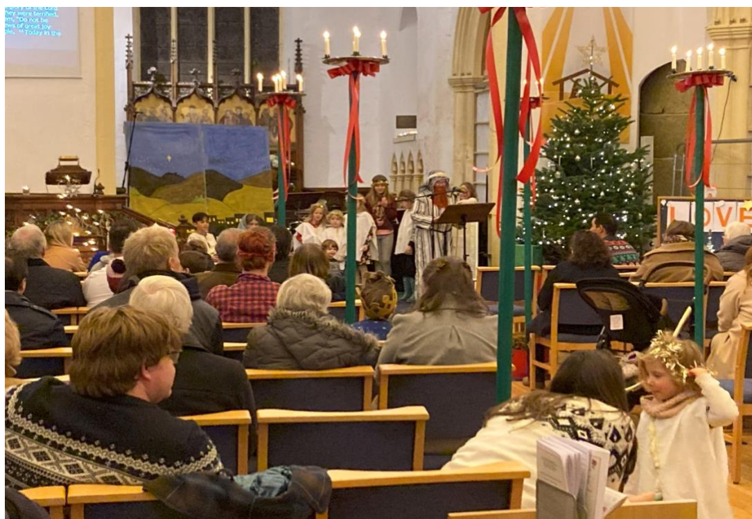
Our Christingle service.

The nearby A12 gives easy access to Ipswich, and places further afield.